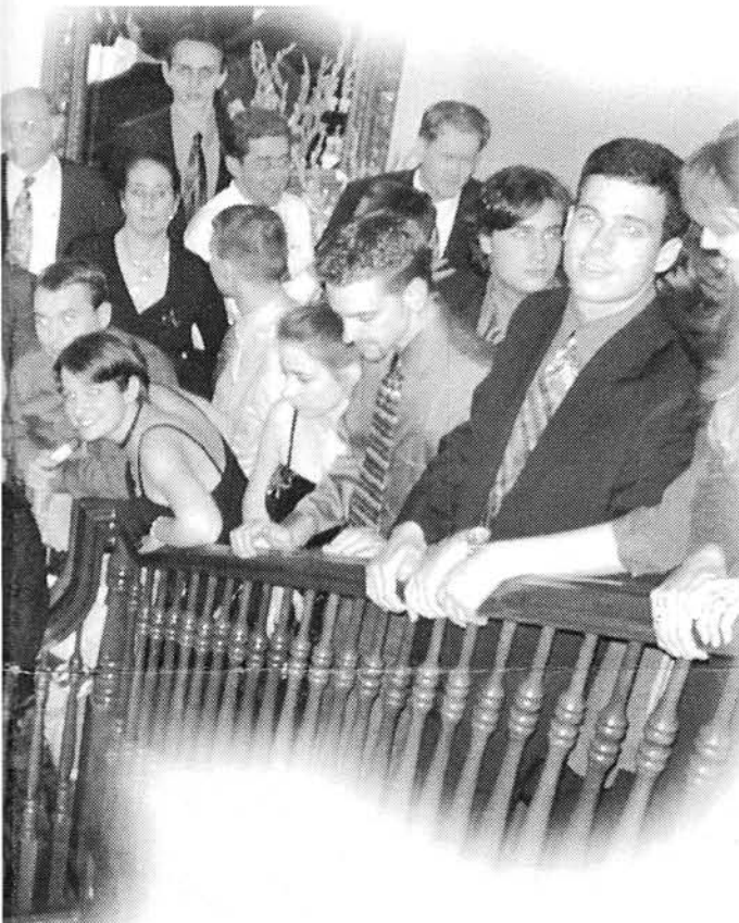
Filling Little Italy

Building Museum and the interior design led free-time allowed ample opportunity an museums, the Presidents' and war